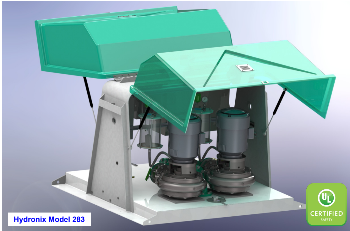
Hydronix Model 283

In addition to our 180 Series Self Priming lift stations, Hydronix also offers vertical, end suction pumps with an integral vacuum priming system. These solid handling pumps maintain a low NPSHr while offering higher hydraulic efficiency over a wide range of flows. They also offer a lower flow, high head option that often cannot be achieved by submersible and self priming pumps. Both duplex and triplex models are available with pump sizes from 3" through 8".