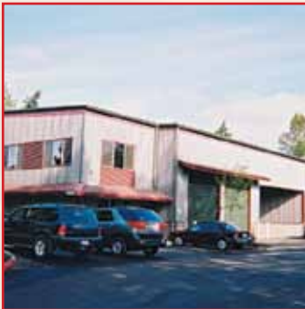
Bellevue Corporate Office