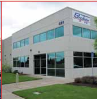
Canby Manufacturing Office