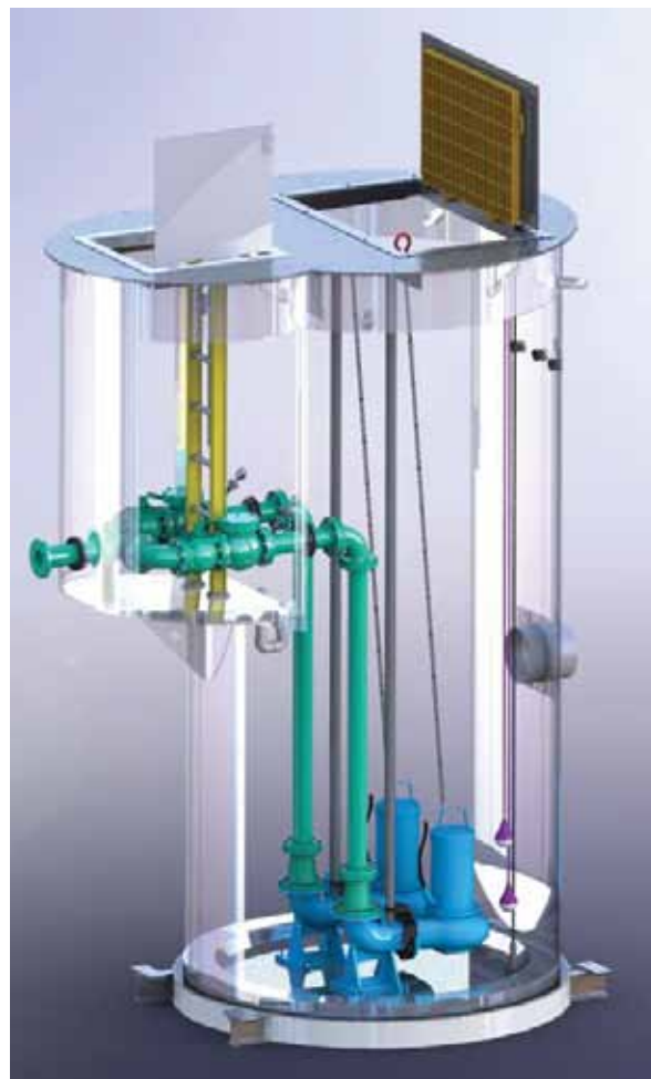
Rosalia Lift Station Hydronix model 421 Sewage Lift Station