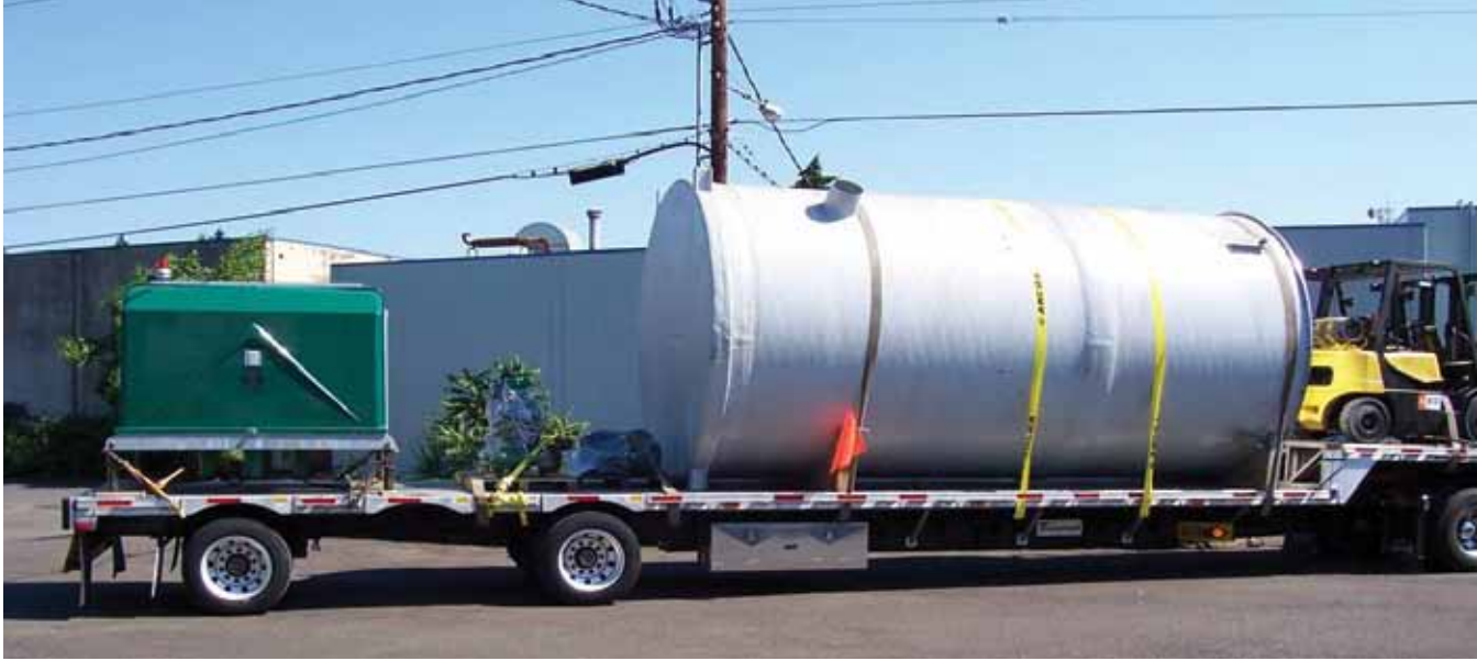
Hydronix 435 Valve and Control Vault with Fiberglass Wet Well