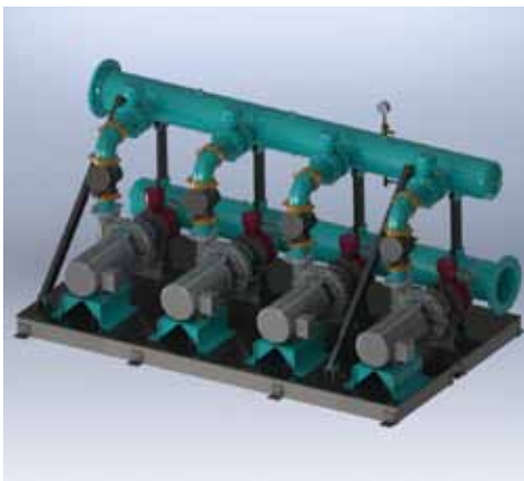
Firgrove Mutual Water Hydronix model 704 Booster Pump Station

drawing that can be e-mailed, then manipulated by it's recipient, without special software. If you would like a sample of PumpTech's Hydronix packaged pumping systems sent to you, utilizing this state of the art engineering, please email us at: inquiries@pumptechnw.com .