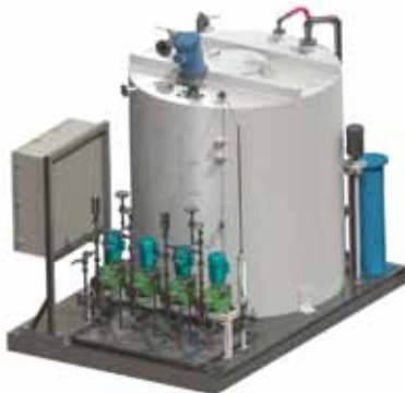
4-Pump Feed System with Make Down Tank.