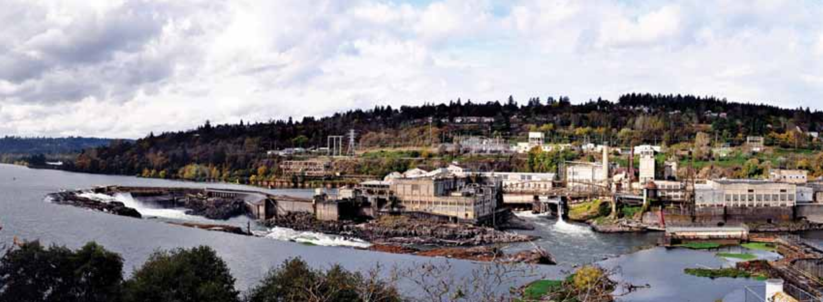
Willamette Falls // West Linn Paper Mill near our manufacturing facility in Canby, Oregon.