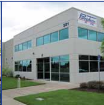
Canby Manufacturing Office