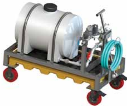
Custom Chemical Feed Cart

If you would like a sample of PumpTech's MeterMan Systems sent to you, utilizing this state of the art engineering, please email us at: inquiries@pumptechnw.com .