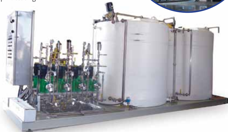
Phosphate Feed Skid