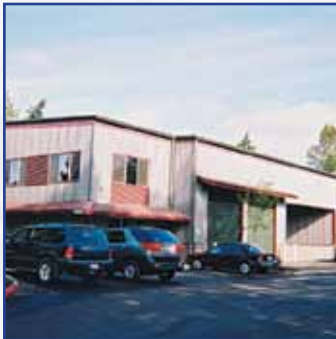
Bellevue Corporate Office