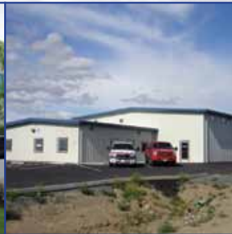
Moses Lake Eastern Branch Office