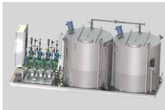
4-Pump Chemical Feed with Dual Tanks